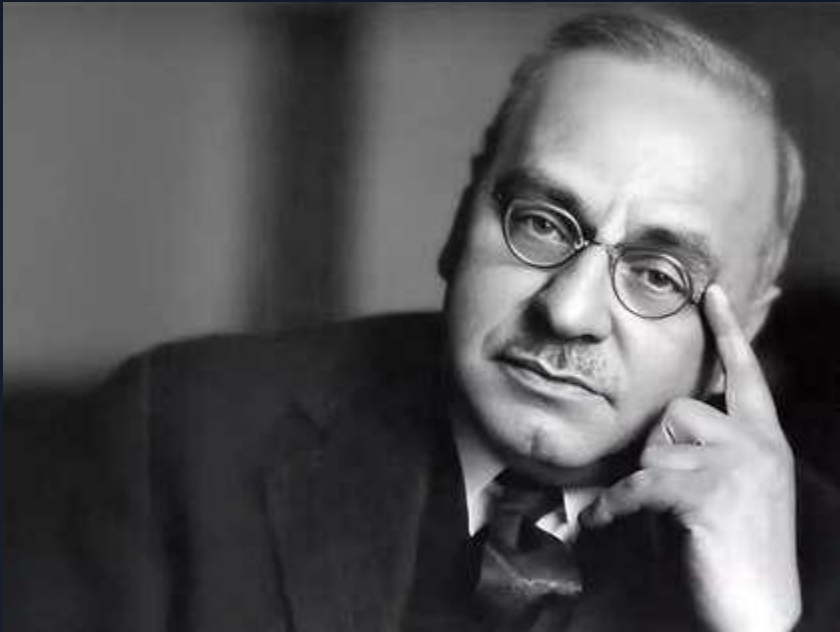
Alfred Adler (1870–1937)

From individual suffering to collective care: