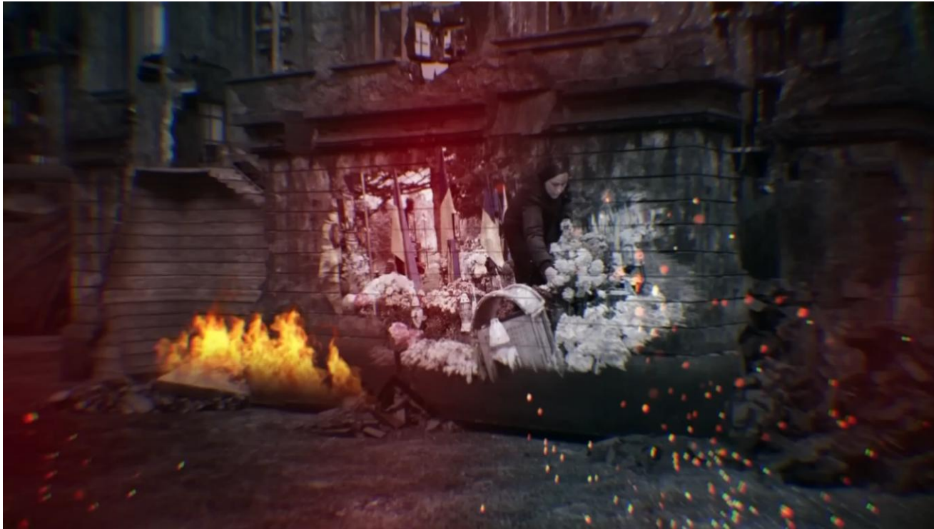
M1 (public tv)